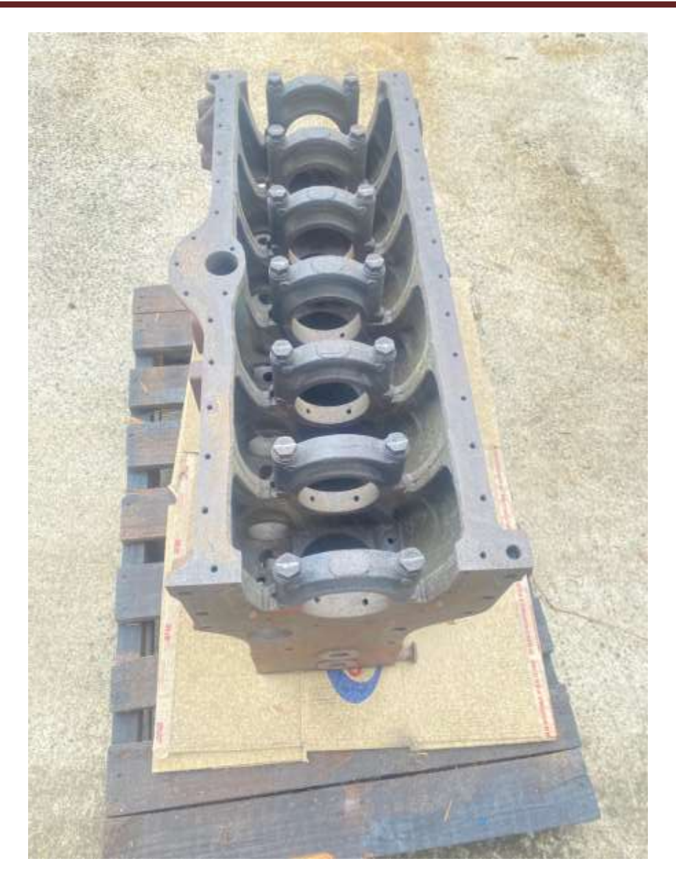
OM360A ENGINE BLOCK + PARTS AND CYLINDER HEADS NO CRANK SHAFT $700.00 + GST