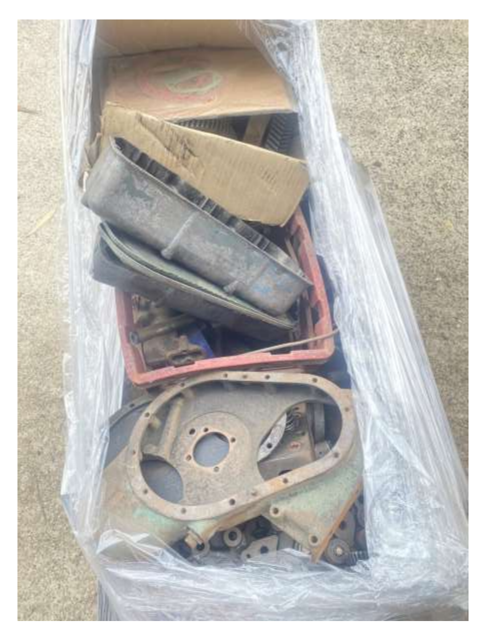
MERCEDES OM360A ENGINE PARTS WITH CYLINDER HEADS SOLD WITH ENGINE BLOCK ABOVE