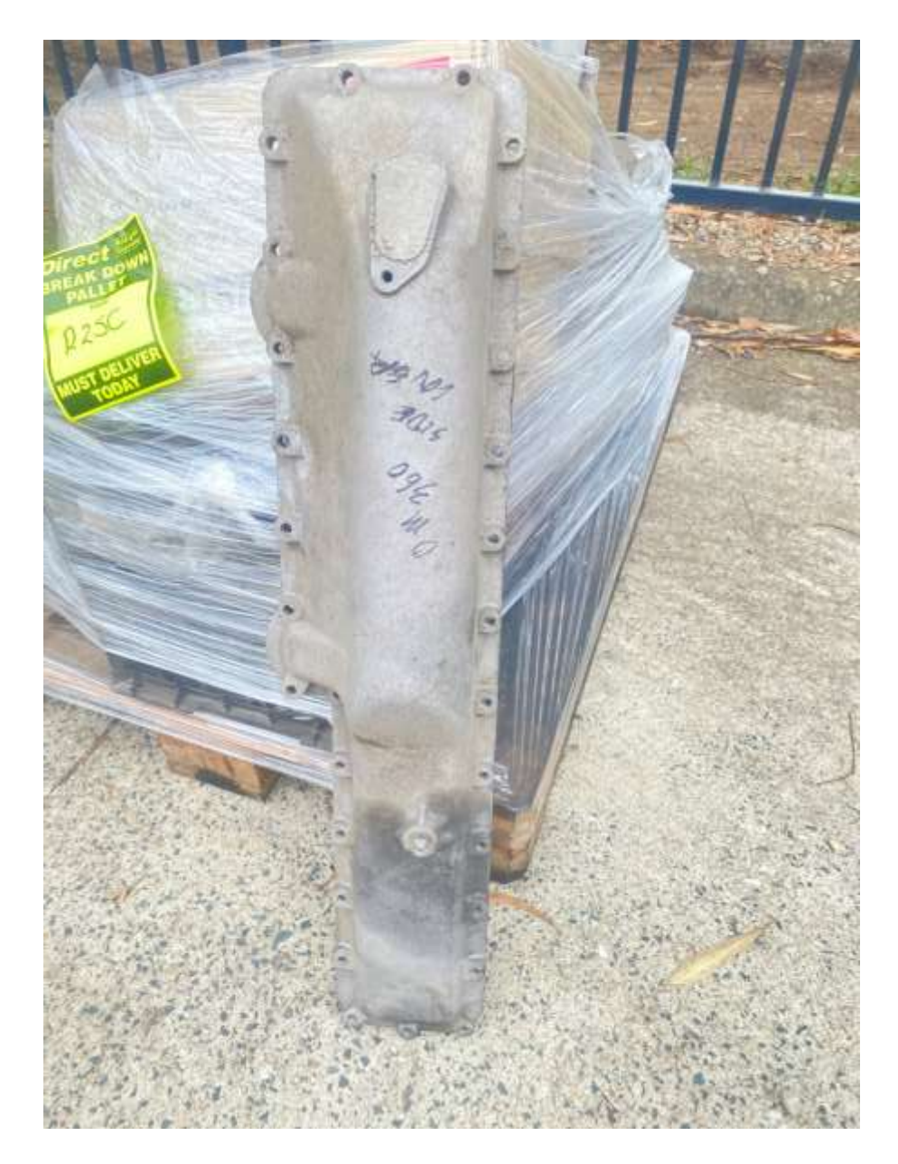
MERCEDES OM360A OIL COOLER COVER IN VERY GOOD CONDITION $500.00 +