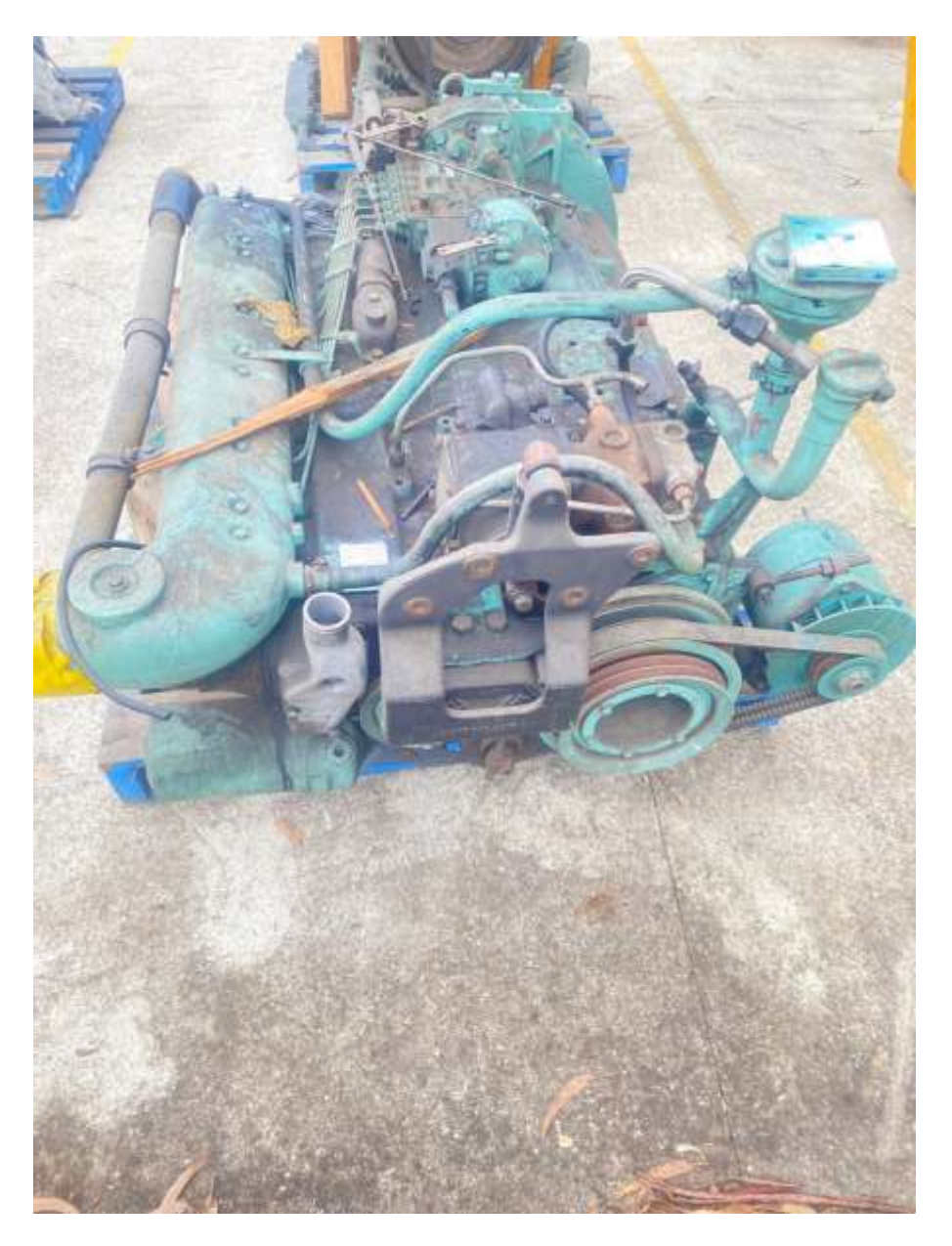
MERCEDES OM447H GOOD RUNNING ENGINE RECONDITIONED DECEMBER 2010 BY DUNCAN FORSTER SOLD AS IS NO WARRANTY $1200.00 + GST