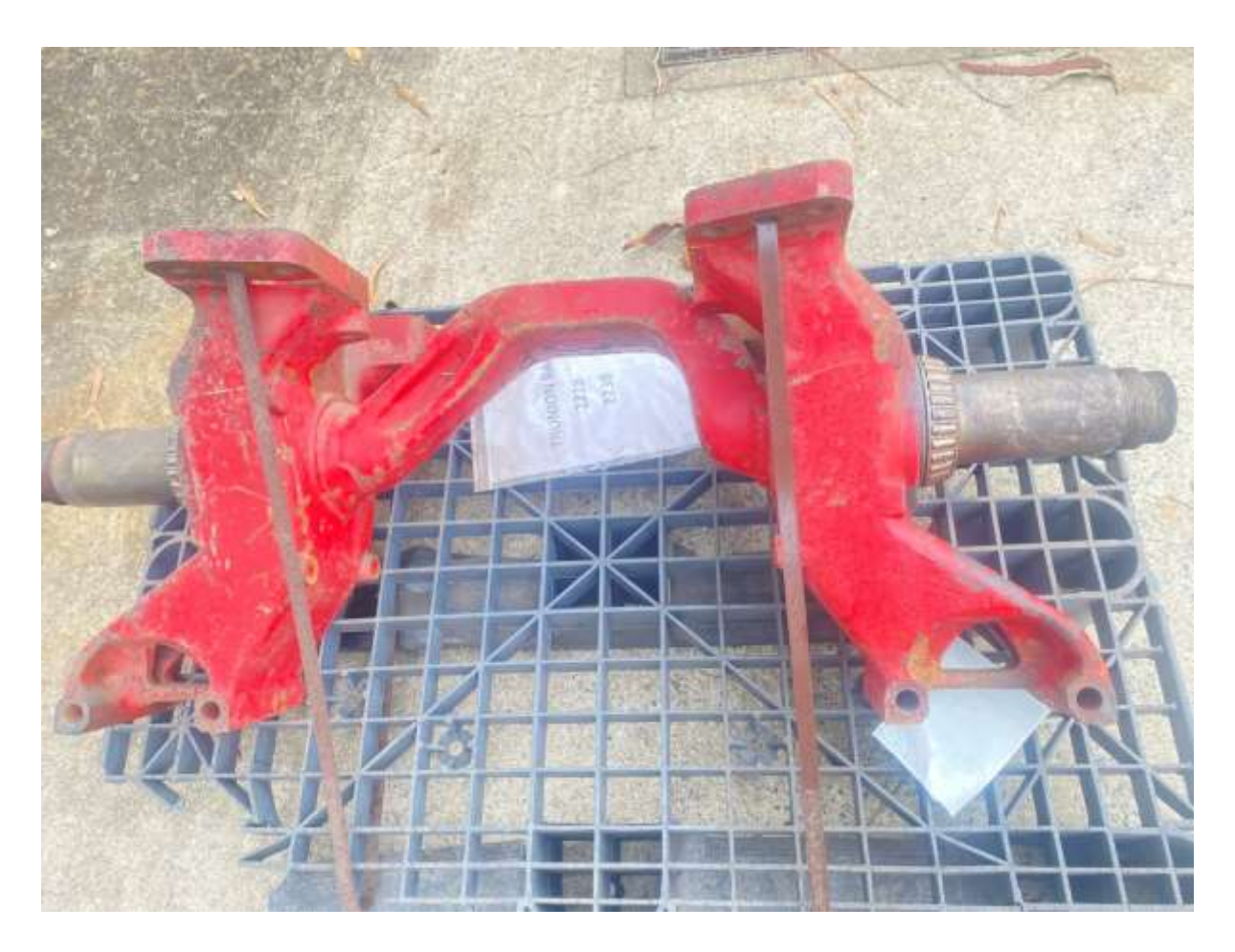
MERCEDES 22 TON TRUNNION DEAD AXLE

SUITS MOST V SERIES AND SK, EXCEPT 2219 2222 2225 2232