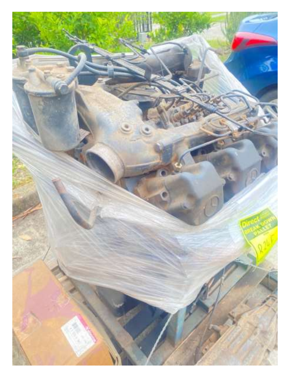
MERCEDES OM441LA CORE ENGINE CONDITION UKNOWN