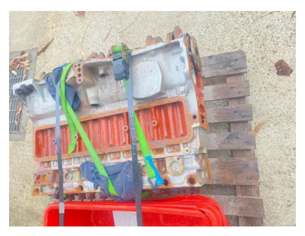
MERCEDES OM366LA NEW ENGINE FITTED AND RUN FOR 4 MONTHS HAS A DAMAGED HEAD STUD WHOLE $700.00 + GST